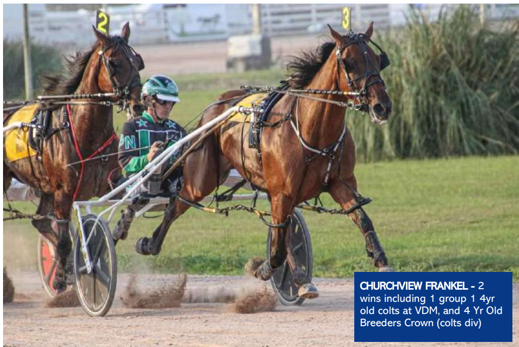
CHURCHVIEW FRANKEL - 2 wins including 1 group 1 4yr old colts at VDM, and 4 Yr Old Breeders Crown (colts div)