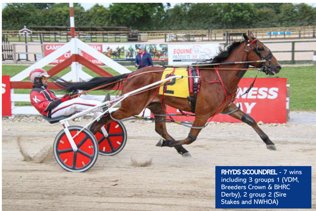
RHYDS SCOUNDREL - 7 wins including 3 groups 1 (VDM, Breeders Crown & BHRC Derby), 2 group 2 (Sire Stakes and NWHOA)