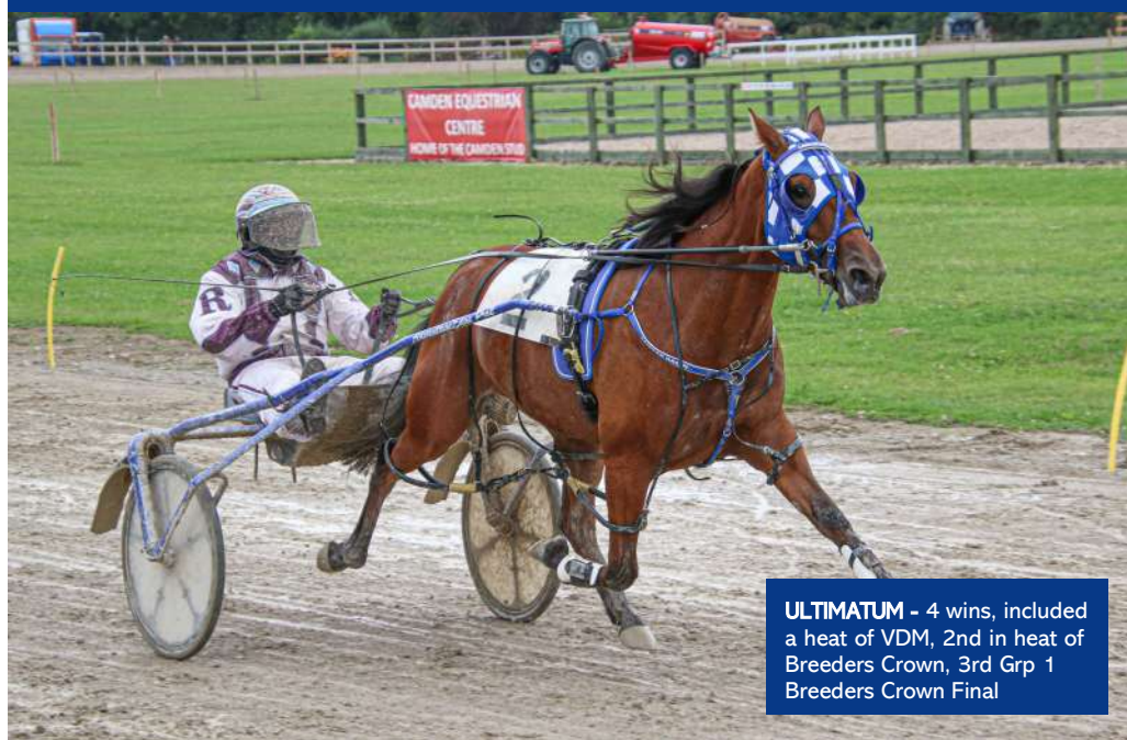
ULTIMATUM - 4 wins, included a heat of VDM, 2nd in heat of Breeders Crown, 3rd Grp 1 Breeders Crown Final