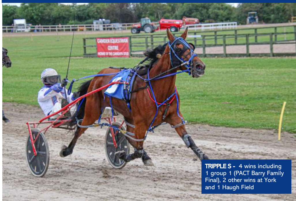
TRIPPLE S - 4 wins including 1 group 1 (PACT Barry Family Final), 2 other wins at York and 1 Haugh Field