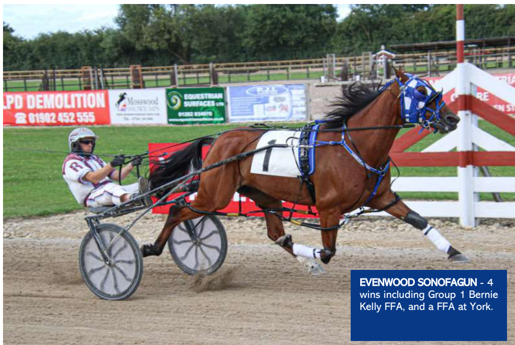
EVENWOOD SONOFAGUN - 4 wins including Group 1 Bernie Kelly FFA, and a FFA at York.