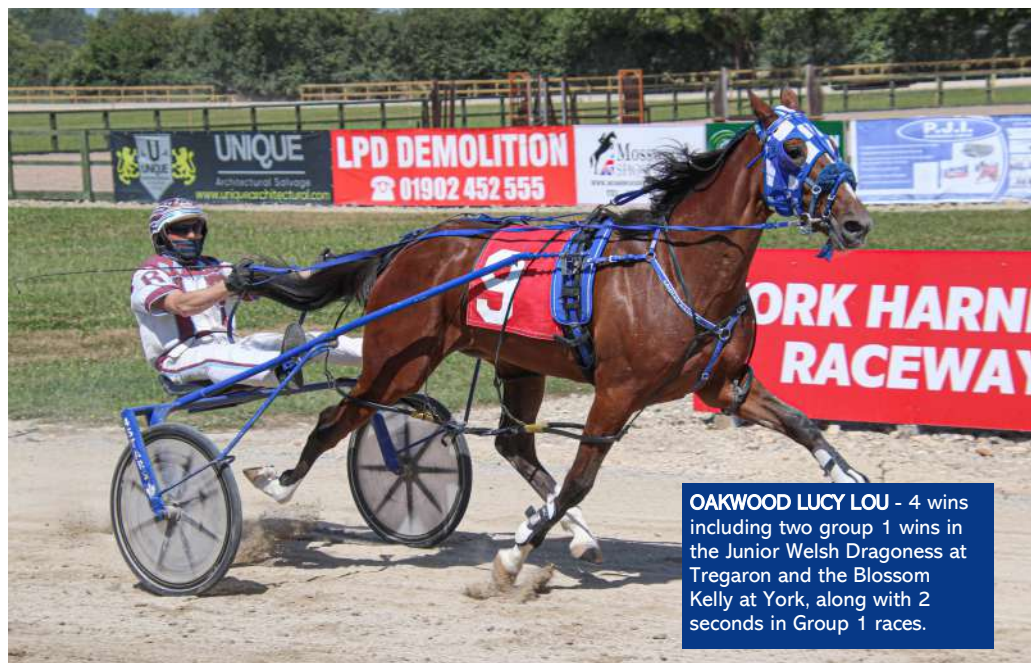
OAKWOOD LUCY LOU - 4 wins including two group 1 wins in the Junior Welsh Dragoness at Tregaron and the Blossom Kelly at York, along with 2 seconds in Group 1 races.