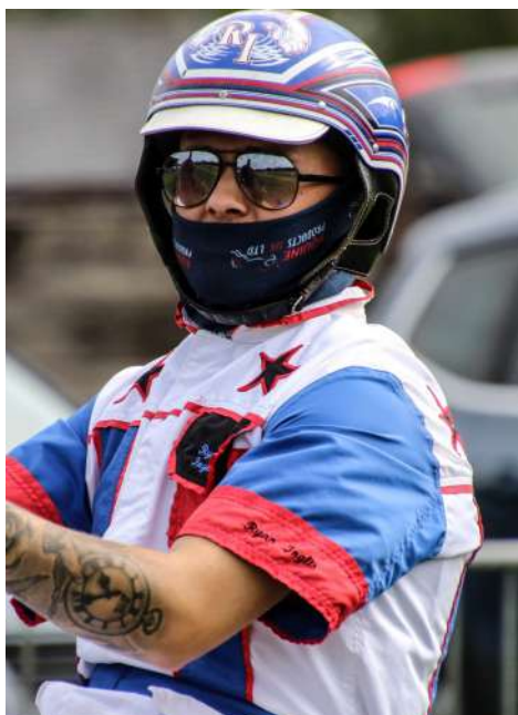
B CLASS DRIVER