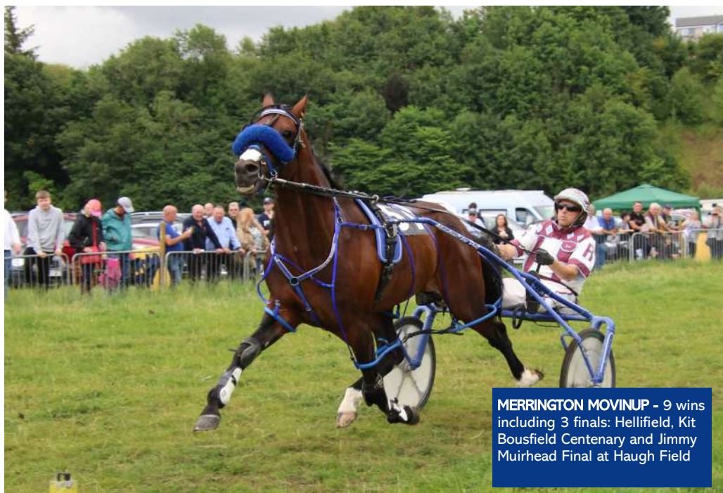
MERRINGTON MOVINUP - 9 wins including 3 finals: Hellifield, Kit Bousfield Centenary and Jimmy Muirhead Final at Haugh Field