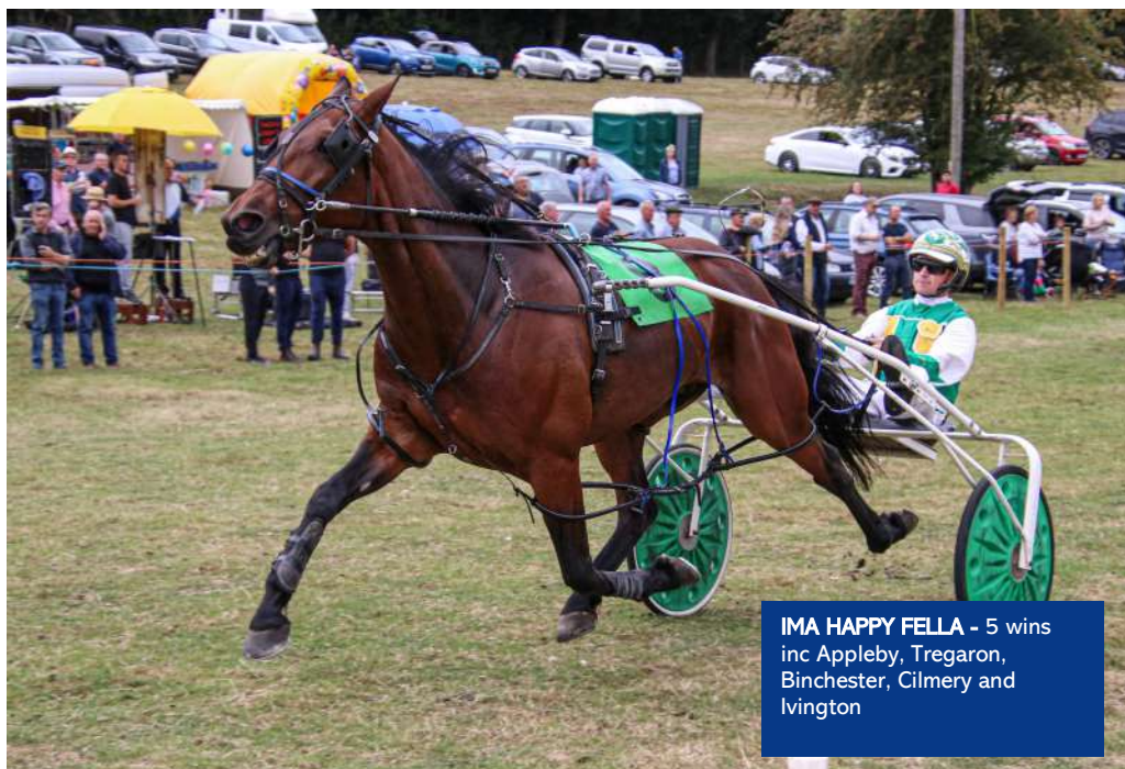
IMA HAPPY FELLA - 5 wins inc Appleby, Tregaron, Binchester, Cilmerly and Ivington