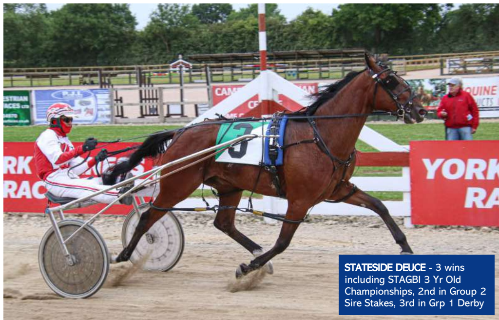
STATESIDE DEUCE - 3 wins including STAGBI 3 Yr Old Championships, 2nd in Group 2 Sire Stakes, 3rd in Grp 1 Derby