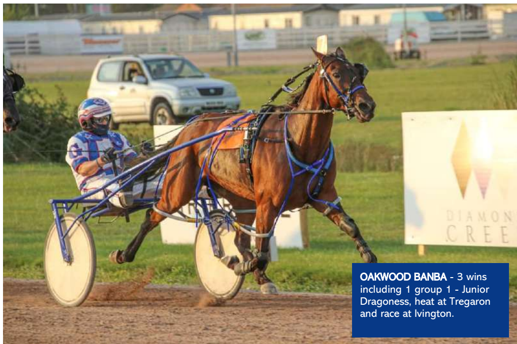
OAKWOOD BANBA - 3 wins including 1 group 1 - Junior Dragoness, heat at Tregaron and race at Ivington.