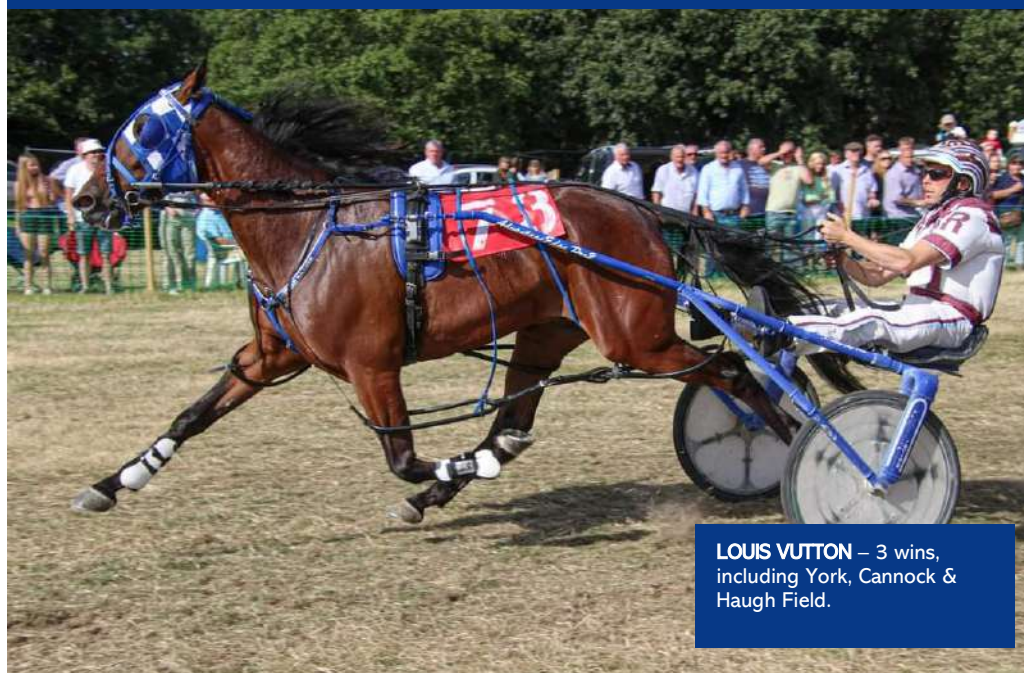
LOUIS VUTTON – 3 wins, including York, Cannock & Haugh Field.