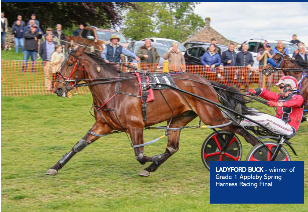
LADYFORD BUCK - winner of Grade 1 Appleby Spring Harness Racing Final