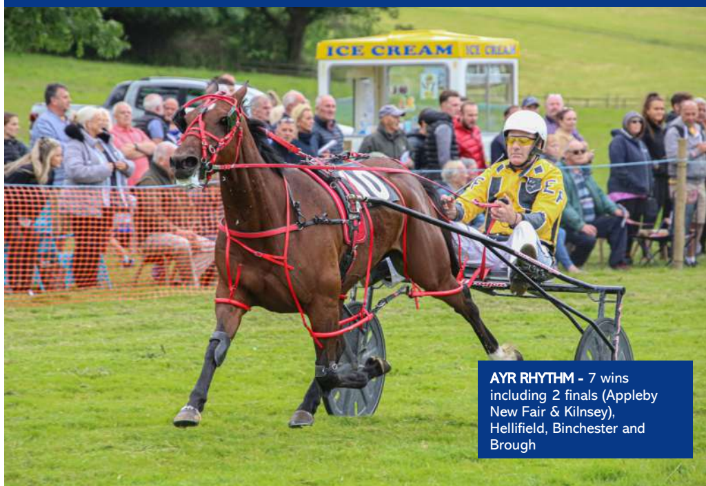
AYR RHYTHM - 7 wins including 2 finals (Appleby New Fair & Kilnsey), Hellifield, Binchester and Brough