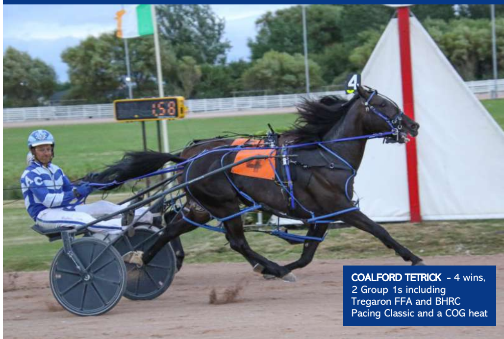
COALFORD TETRICK - 4 wins, 2 Group 1s including Tregaron FFA and BHRC Pacing Classic and a COG heat