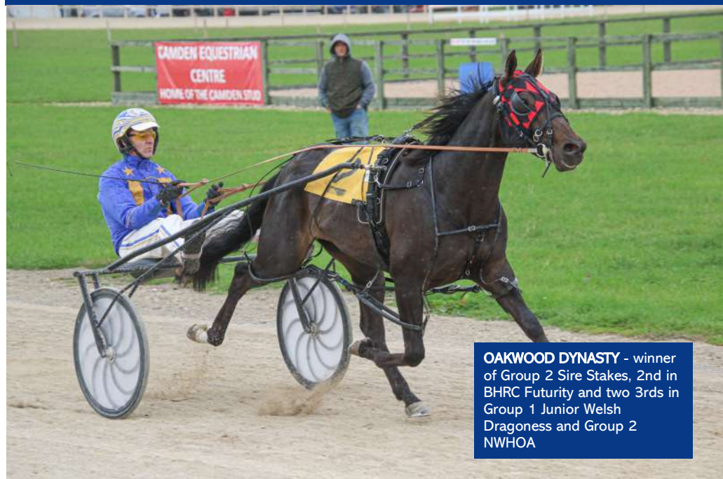
OAKWOOD DYNASTY - winner of Group 2 Sire Stakes, 2nd in BHRC Futurity and two 3rds in Group 1 Junior Welsh Dragoness and Group 2 NWHOA