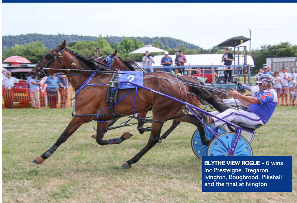
BLYTHE VIEW ROGUE - 6 wins inc Presteigne, Tregaron, Ivington, Boughrood, Pikehall and the final at Ivington