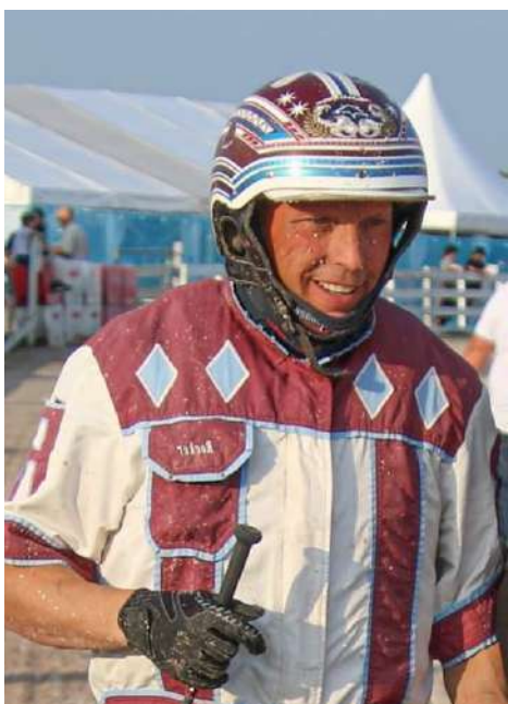
A CLASS DRIVER