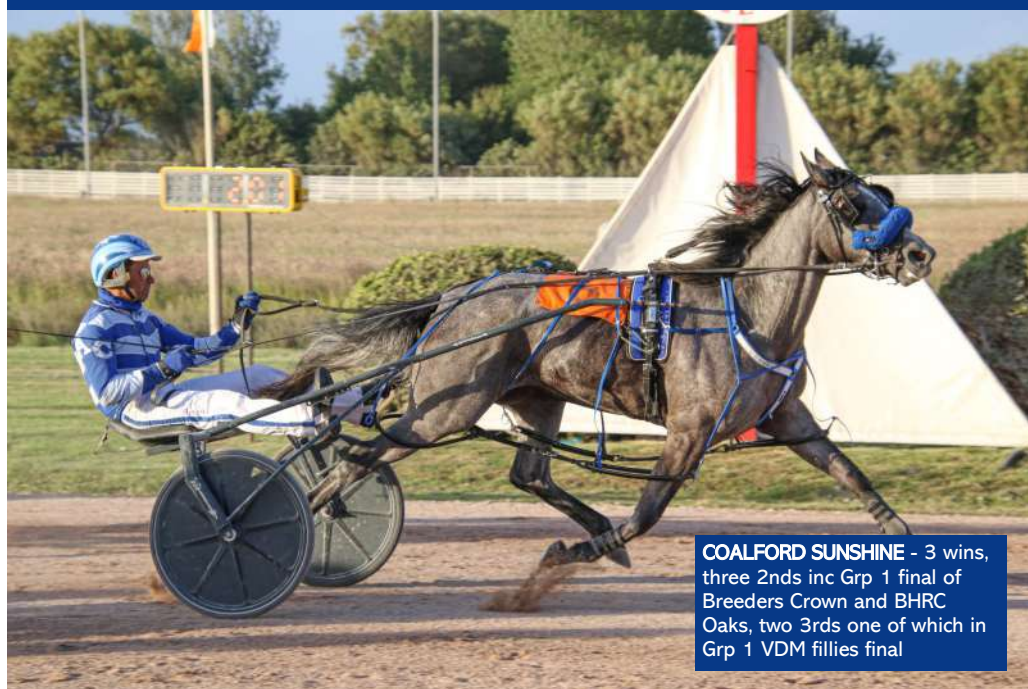
COALFORD SUNSHINE - 3 wins, three 2nds inc Grp 1 final of Breeders Crown and BHRC Oaks, two 3rds one of which in Grp 1 VDM fillies final