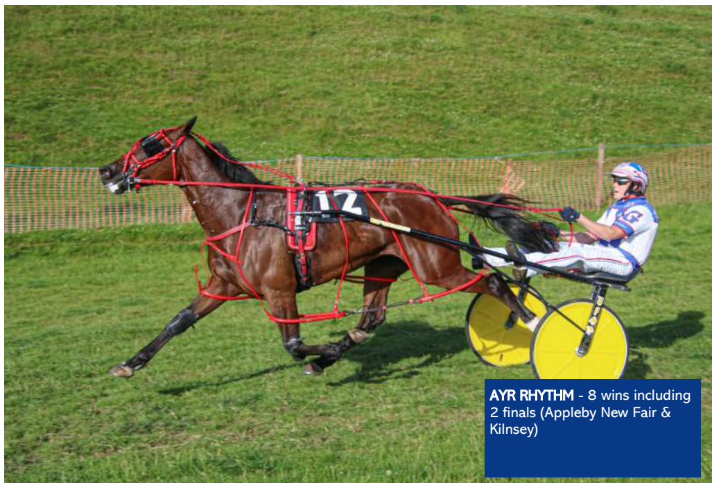
AYR RHYTHM - 8 wins including 2 finals (Appleby New Fair & Kilnsey)