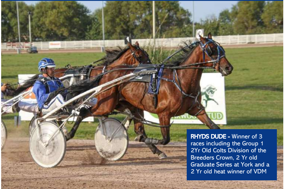
RHYDS DUDE - Winner of 3 races including the Group 1 2Yr Old Colts Division of the Breeders Crown, 2 Yr old Graduate Series at York and a 2 Yr old heat winner of VDM