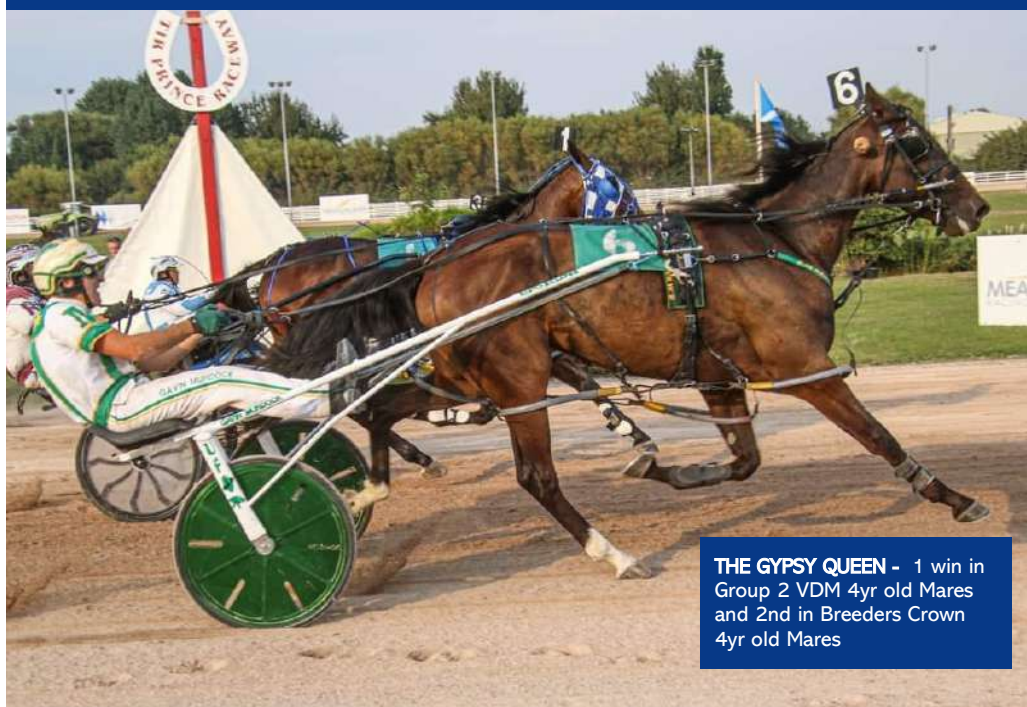
THE GYPSY QUEEN - 1 win in Group 2 VDM 4yr old Mares and 2nd in Breeders Crown 4yr old Mares