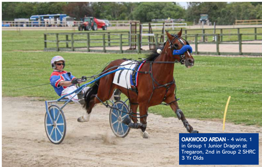
OAKWOOD ARDAN - 4 wins, 1 in Group 1 Junior Dragon at Tregaron, 2nd in Group 2 SHRC 3 Yr Olds