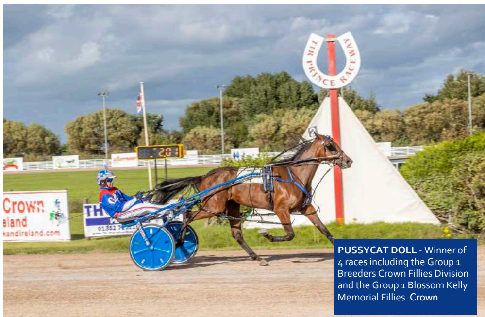
PUSSYCAT DOLL - Winner of 4 races including the Group 1 Breeders Crown Fillies Division and the Group 1 Blossom Kelly Memorial Fillies. Crown