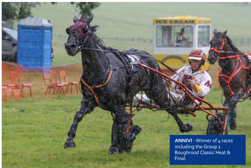
ANNIVI - Winner of 4 races including the Group 2 Boughrood Classic Heat & Final.