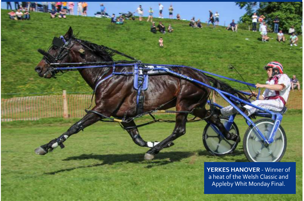
YERKES HANOVER - Winner of a heat of the Welsh Classic and Appleby Whit Monday Final.