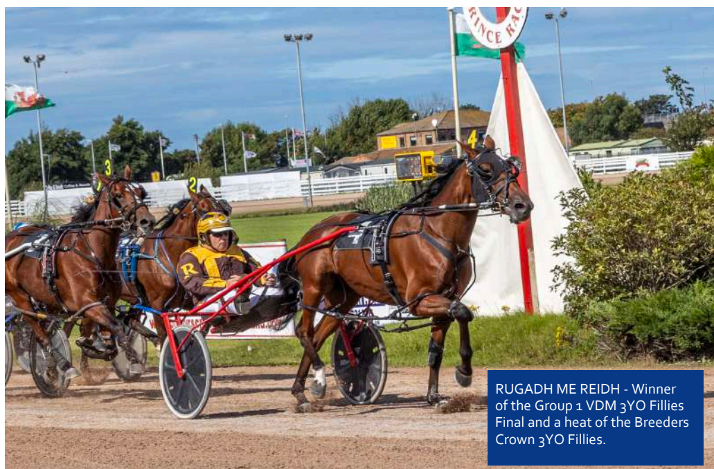
RUGADH ME REIDH - Winner of the Group 1 VDM 3YO Fillies Final and a heat of the Breeders Crown 3YO Fillies.