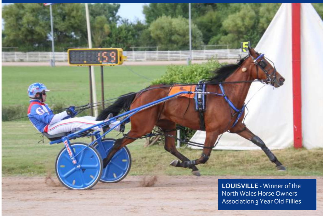
LOUISVILLE - Winner of the North Wales Horse Owners Association 3 Year Old Fillies