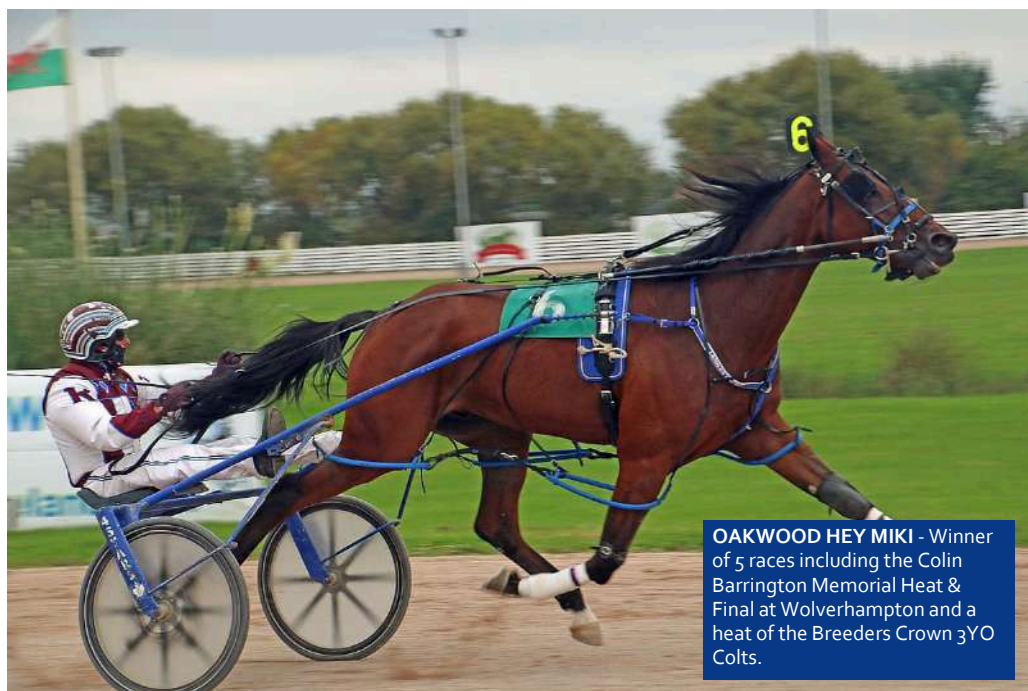
OAKWOOD HEY MIKI - Winner of 5 races including the Colin Barrington Memorial Heat & Final at Wolverhampton and a heat of the Breeders Crown 3YO Colts.