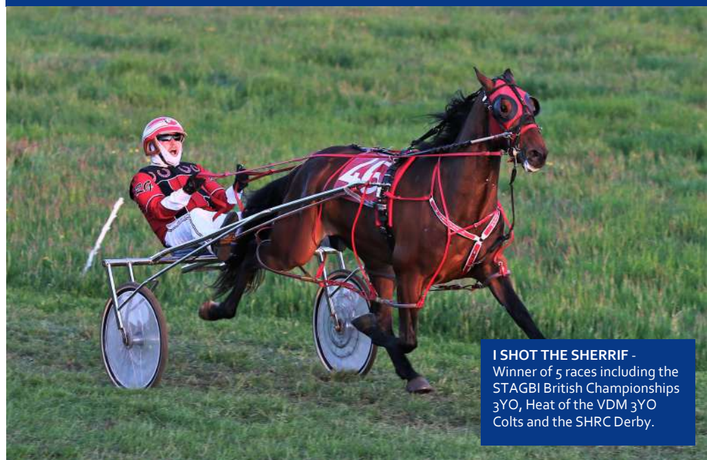
I SHOT THE SHERRIF - Winner of 5 races including the STAGBI British Championships 3YO, Heat of the VDM 3YO Colts and the SHRC Derby.