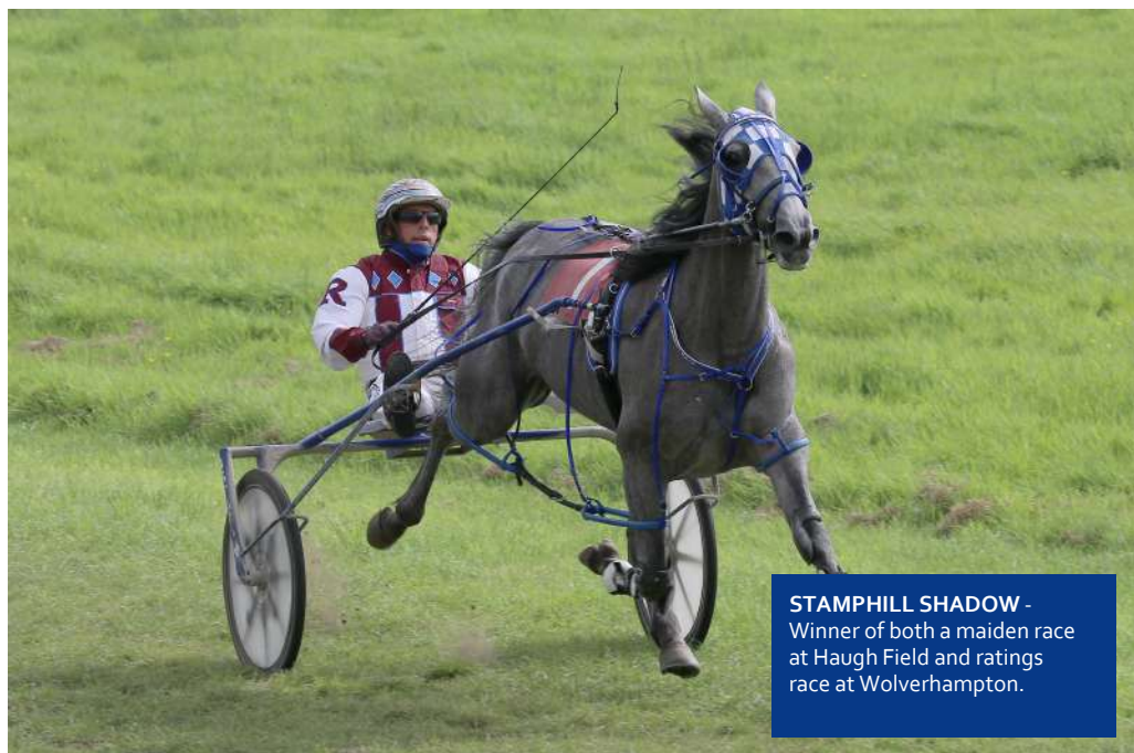
STAMPHILL SHADOW - Winner of both a maiden race at Haugh Field and ratings race at Wolverhampton.