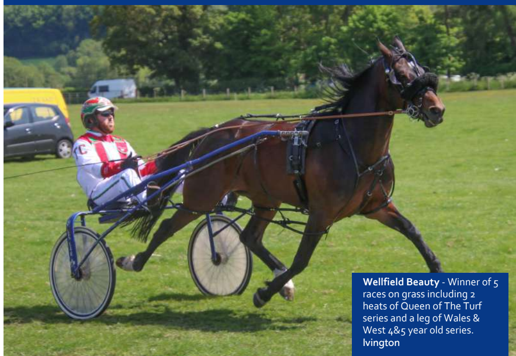
Wellfield Beauty - Winner of 5 races on grass including 2 heats of Queen of The Turf series and a leg of Wales & West 4&5 year old series. Ivington