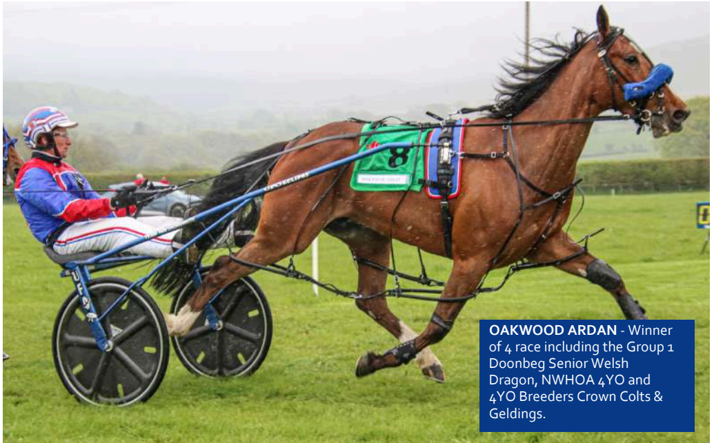
OAKWOOD ARDAN - Winner of 4, race including the Group 1 Doonbeg Senior Welsh Dragon, NWHOA 4YO and 4YO Breeders Crown Colts & Geldings.