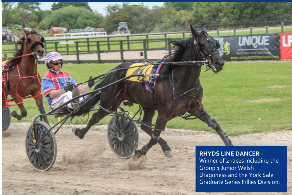
RHYDS LINE DANCER - Winner of 2 races including the Group 1 Junior Welsh Dragoness and the York Sale Graduate Series Fillies Division.