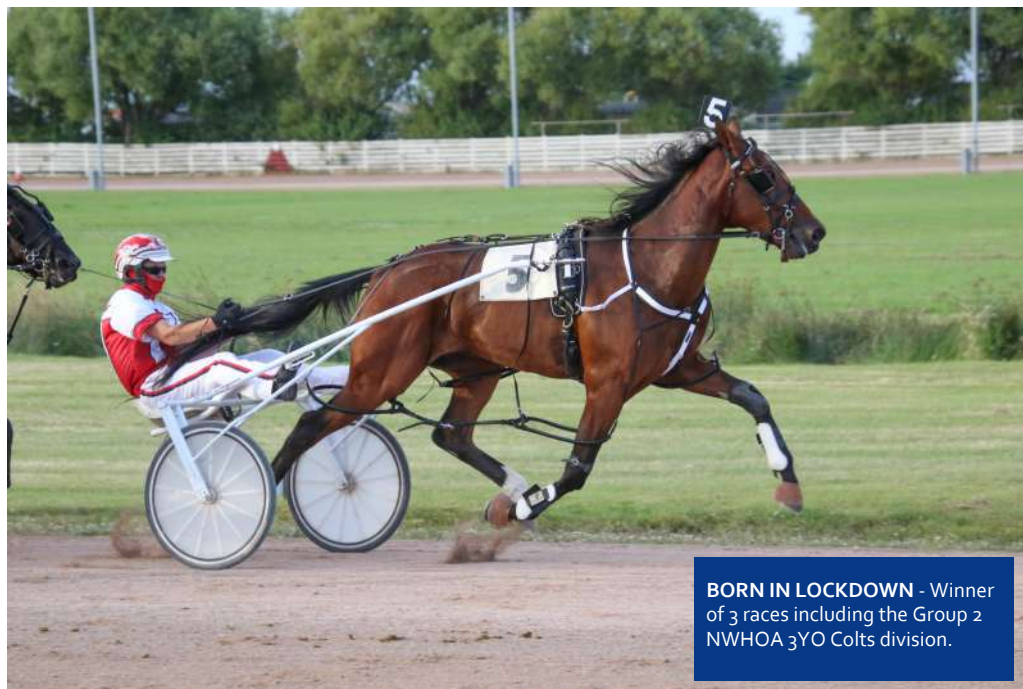
BORN IN LOCKDOWN - Winner of 3 races including the Group 2 NWHOA 3YO Colts division.