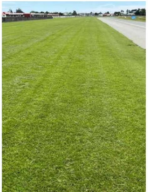
Pictured above Swayze winning the New Zealand Cup. Pictured right West Port Turf Track NZ.

The is the time of the year where the Australian focus turns to the Interdominion, an event in years gone by the premier showcase of the sport in NZ and Australia. Unfortunately that is no longer the case with NZ trainers showing no interest.