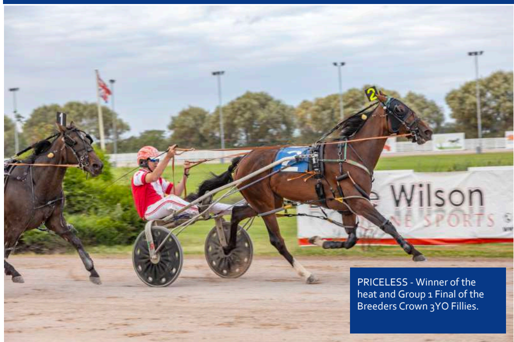
PRICELESS - Winner of the heat and Group 1 Final of the Breeders Crown 3YO Fillies.