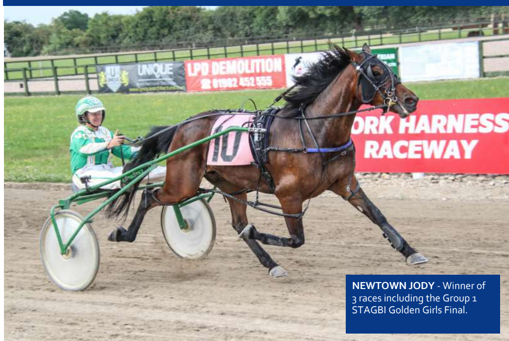
NEWTOWN JODY - Winner of 3 races including the Group 1 STAGBI Golden Girls Final.