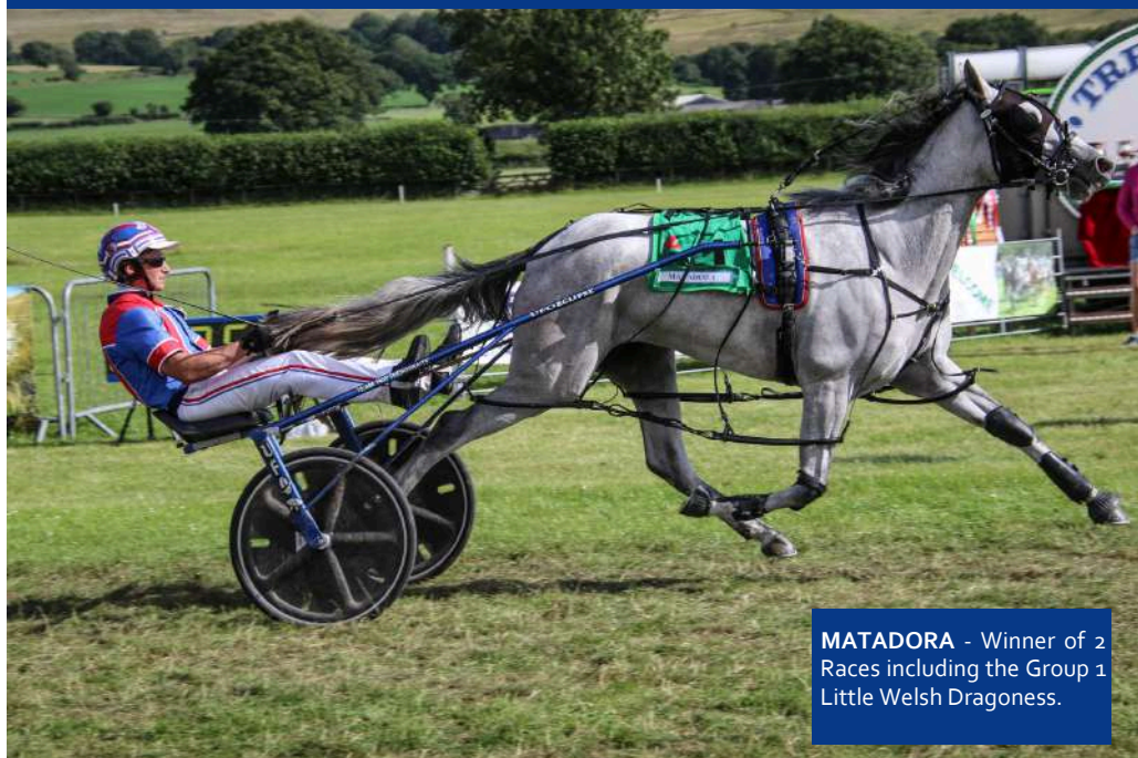
MATADORA - Winner of 2 Races including the Group 1 Little Welsh Dragoness.