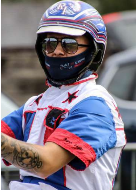
B CLASS DRIVER