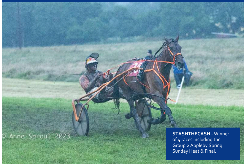
STASHTHECASH - Winner of 4 races including the Group 2 Appleby Spring Sunday Heat & Final.