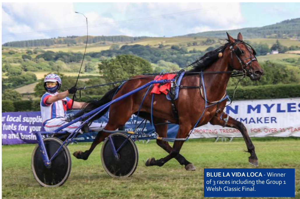
BLUE LA VIDA LOCA - Winner of 3 races including the Group 1 Welsh Classic Final.