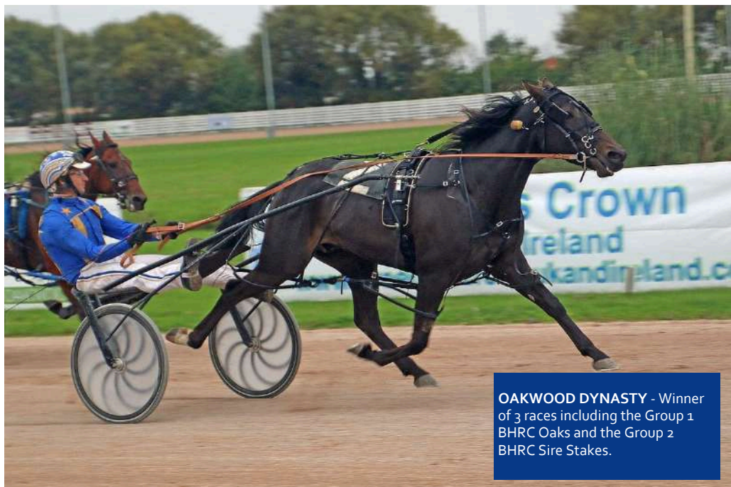
OAKWOOD DYNASTY - Winner of 3 races including the Group 1 BHRC Oaks and the Group 2 BHRC Sire Stakes.