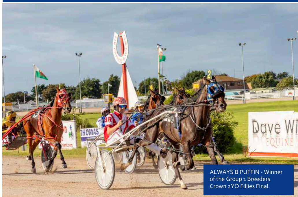
ALWAYS B PUFFIN - Winner of the Group 1 Breeders Crown 2YO Fillies Final.