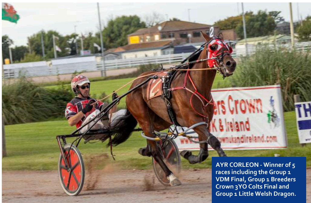
AYR CORLEON - Winner of 5 races including the Group 1 VDM Final, Group 1 Breeders Crown 3YO Colts Final and Group 1 Little Welsh Dragon.