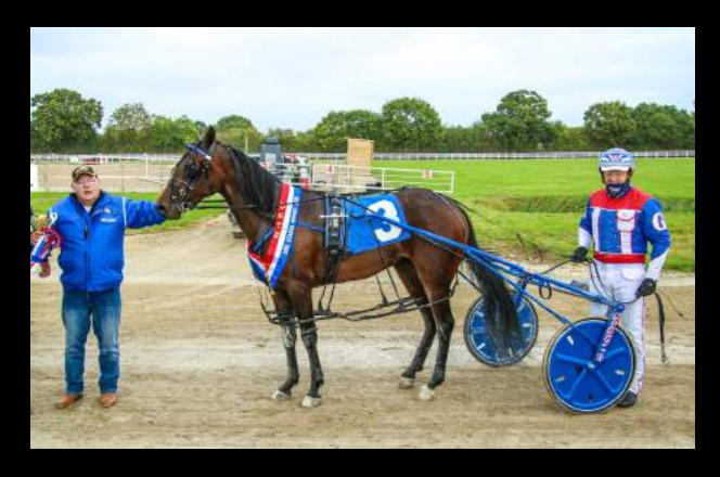
3 Yr Old Filly of the Year: She Be Stunning