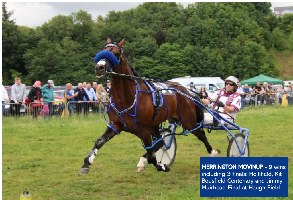
MERRINGTON MOVINUP - 9 wins including 3 finals: Hellifield, Kit Bousfield Centenary and Jimmy Muirhead Final at Haugh Field