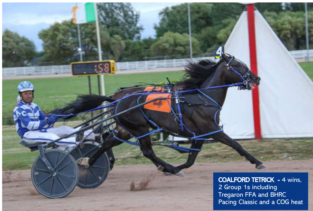
COALFORD TETRICK - 4 wins, 2 Group 1s including Tregaron FFA and BHRC Pacing Classic and a COG heat