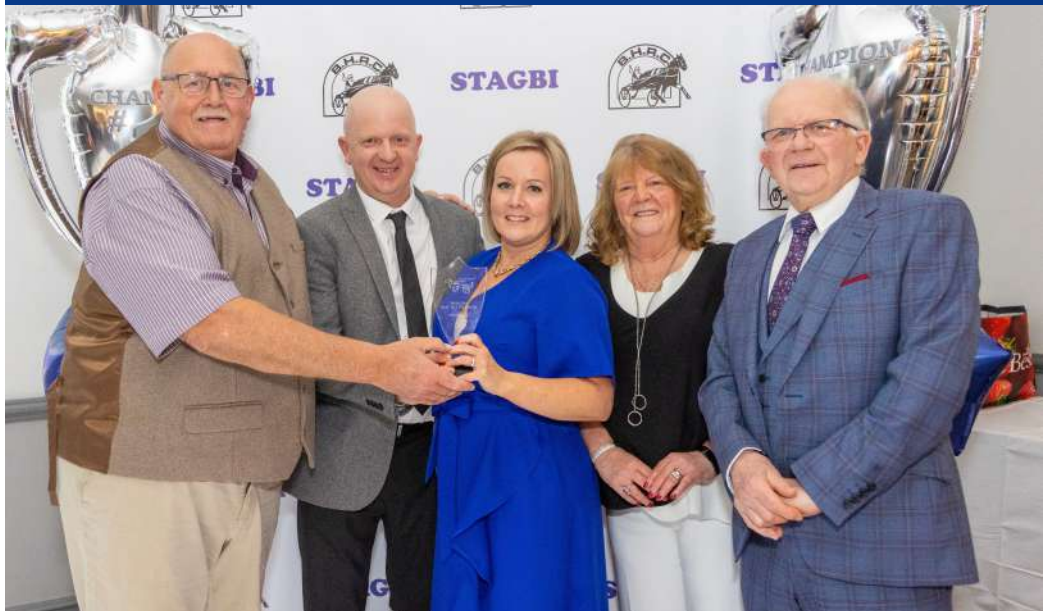
BHRC LEADING HORSE – Louisiana