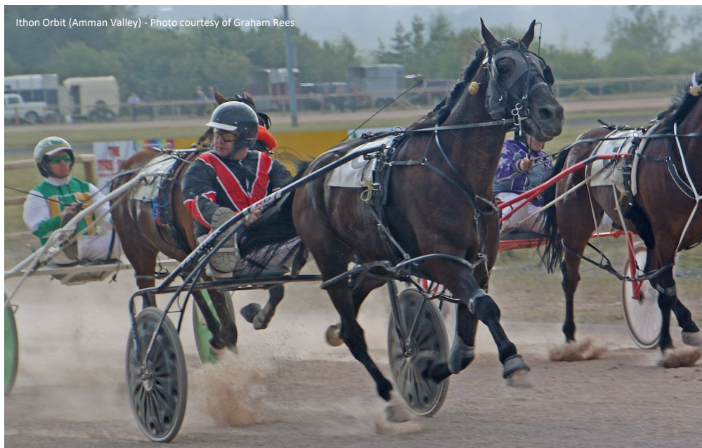
Ithon Orbit (Amman Valley)

July 25 th was a return to Amman Valley with