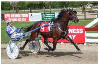
COALFORD TURNITUP NWH0A2YO