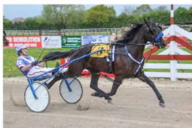
COALFORD HITMAN P2.02