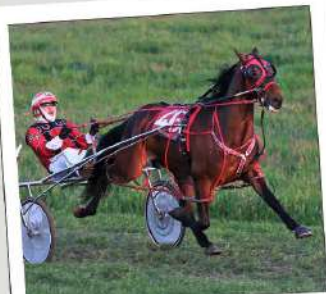
I Shot The Sherriff