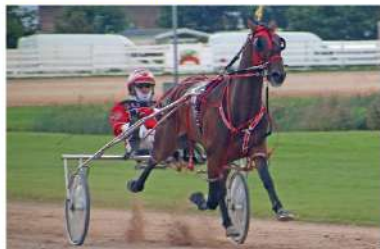
COALFORD TOPGUY P1.59