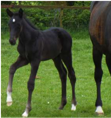
10 Day Old Mahogany Charmer