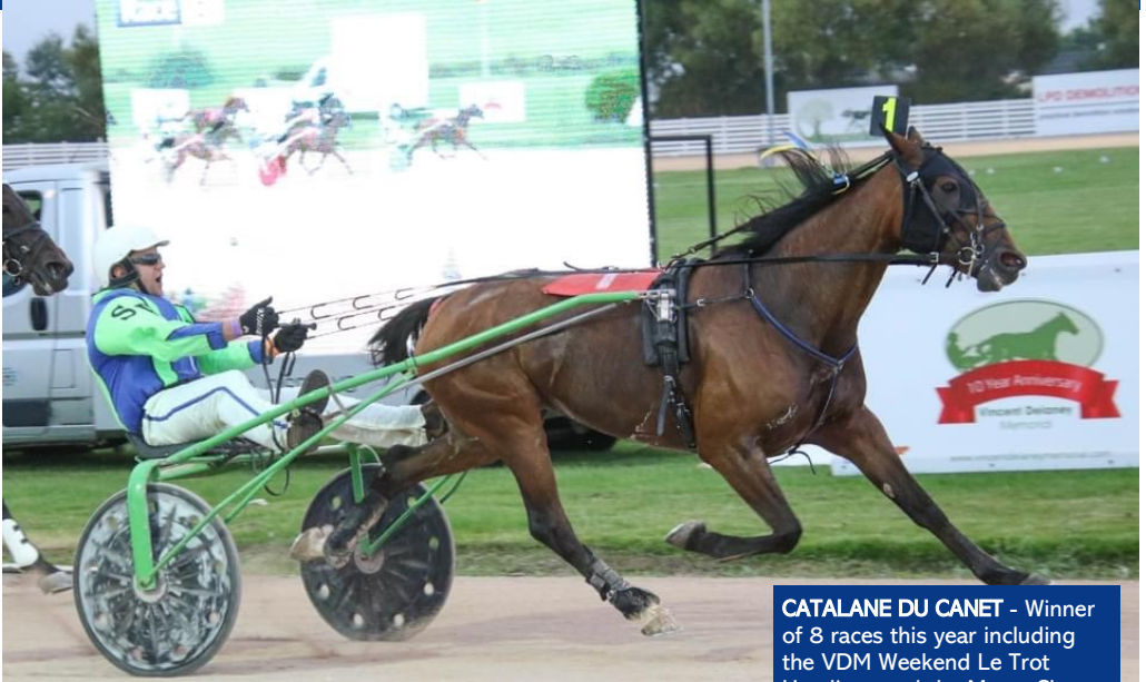
CATALANE DU CANET - Winner of 8 races this year including the VDM Weekend Le Trot Handicap and the Mares Championship on York Sale Day