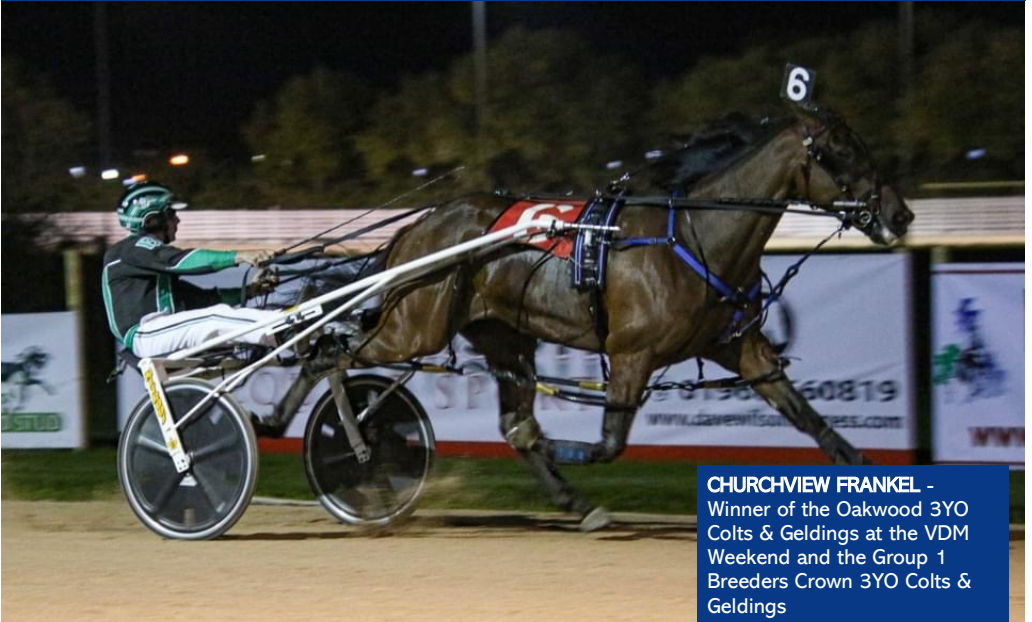
CHURCH-VIEW FRANKEL - Winner of the Oakwood 3YO Colts & Geldings at the VDM Weekend and the Group 1 Breeders Crown 3YO Colts & Geldings